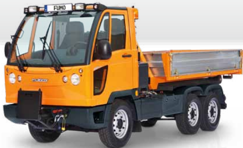
Three-axle model with dumper

The modular vehicle concept of the FUMO opens up a whole range of possibilities. You can decide now what equipment you need in order to make money. The FUMO can be retrofitted and converted with the latest technology easily and according to your needs. Depending on the basic model available, you can choose between a short and long wheelbase, between 4x2 and 4x4 drive with crawling gear, between a single and double cab and over a further 20 additional options.