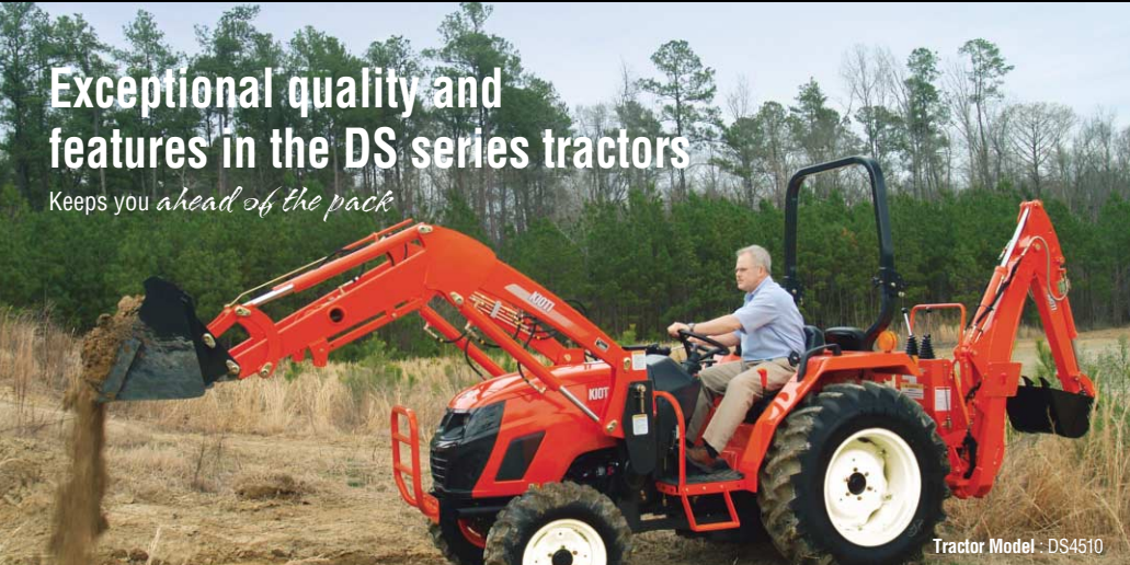
Tractor Model - DS4510